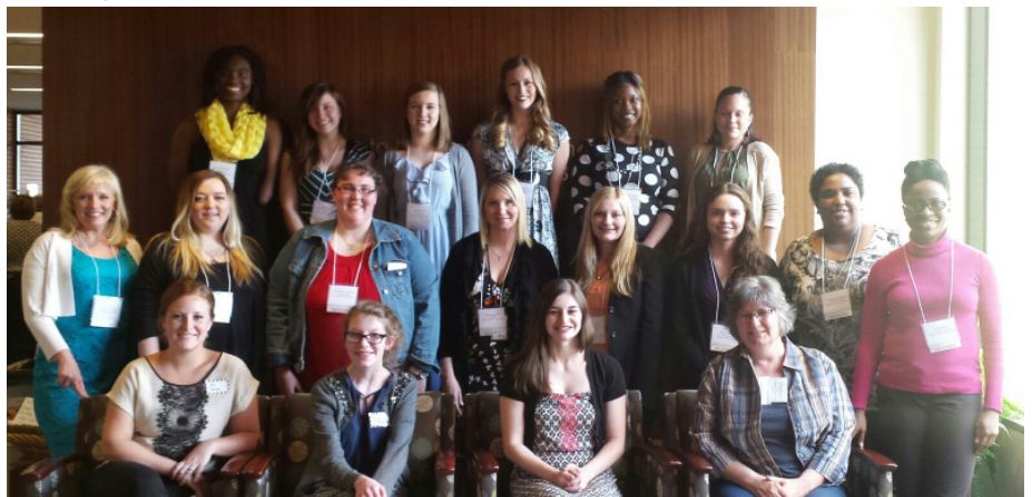
Group photo of all award recipients attending the May 5th reception