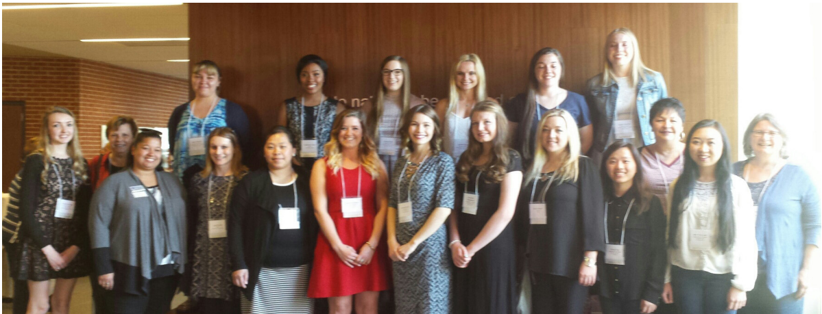
Group photo of all award recipients attending the May 4th reception