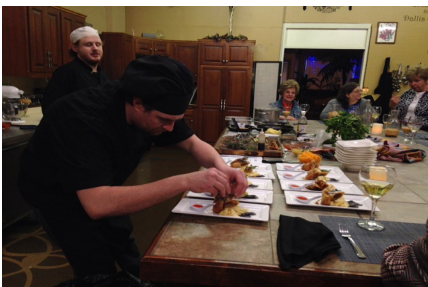
H&H members enjoying dinner at Savory Creations. March 2016.