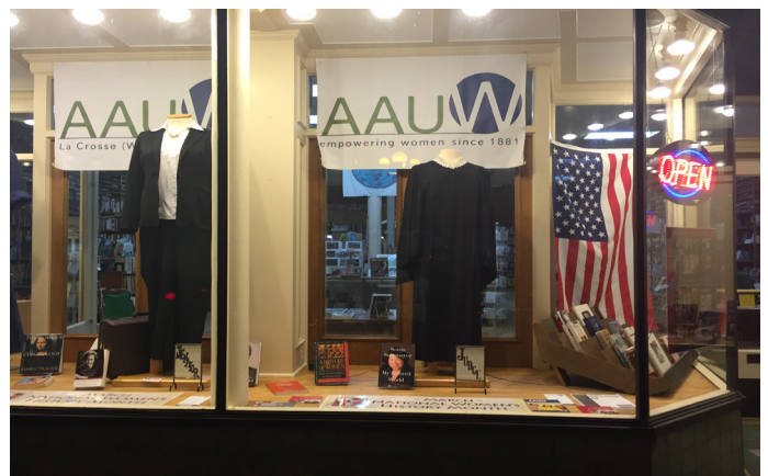
Our Women's History Month display at Pearl St. Books