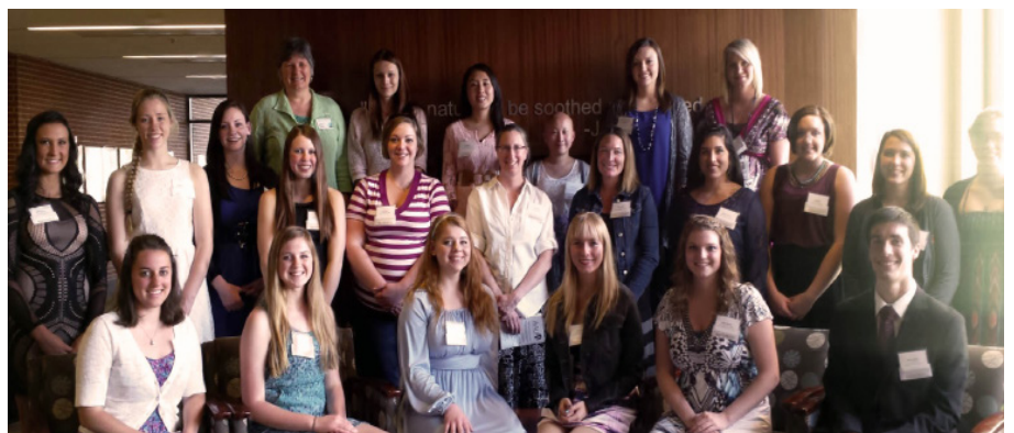
Group photo of all award recipients attending the April 30th reception