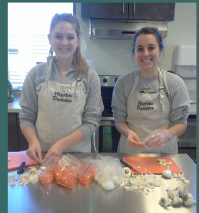
Viterbo Dietetic Students in the Food Lab

The dietetics students will share ways to incorporate these changes into one's daily diet.