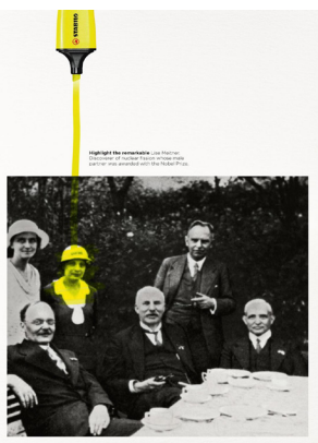
Lise Meitner, the discoverer of nuclear fission whose male partner was awarded the Nobel Prize.

See all the ads at: www.invisionapp.com/blog/stabilo-boss-ad-campaign/