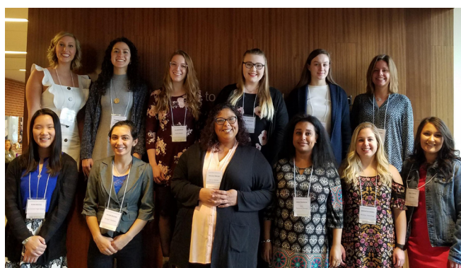
2019 Scholarship recipients attending the May 9th reception