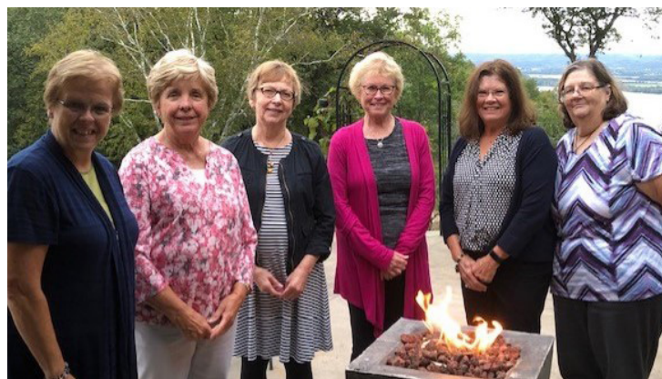
Hearth & Home group from October 2019 enjoying an outing to River View Winery in La Crescent.