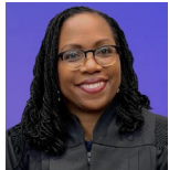
Judge Brown Jackson