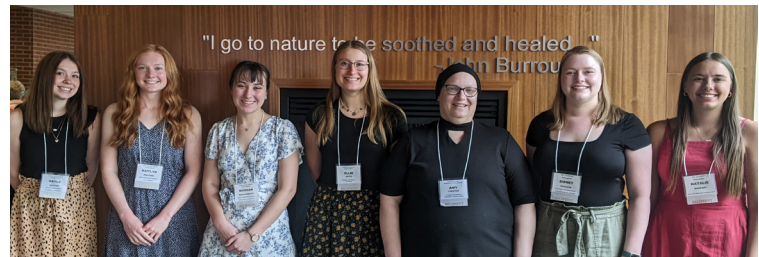
Top picture: 2023 Scholarship recipients attended the May 13th reception and shared their stories with the branch members.