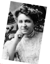
Mary Church Terrell First Black member AAUW 1905

Famed scientist Marie Curie received contributions from ACA members in 1920 to help purchase one gram of radium for her research. In her honor AAUW established the Marie Curie Postdoctoral Fellowship.